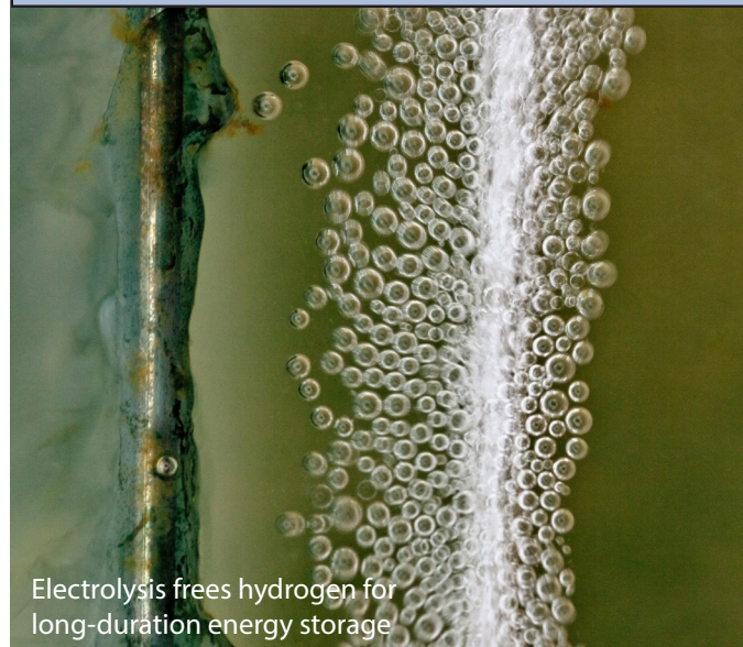
Electrolysis frees hydrogen for long-duration energy storage

We acknowledge fellowships from the Resnick Institute for Sustainability and SoCalGas, and a gift from Gates Ventures LLC to the Carnegie Institution for Science.